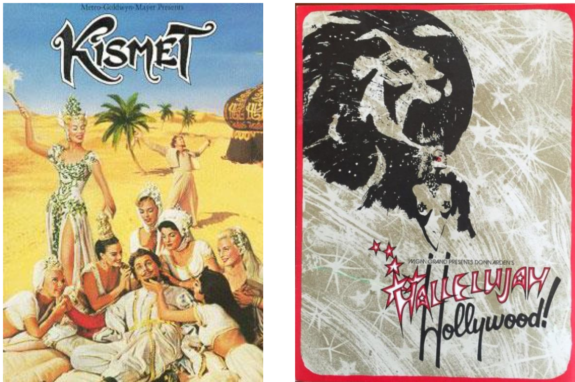
Figure 117: MGM Kismet movie poster (left), and MGM Grand Hallelujah Hollywood! program cover (right)

was a tribute to the MGM movie of that name. It was based almost entirely on music from Kismet , and used characters and settings from that musical. Act IV “Kismet” was performed approximately 1700 times, until July 16, 1976, when, under pressure resulting from this litigation, MGM Grand substituted a new Act IV.