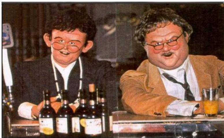
Figure 119: Norm and Cliff characters in Cheers television series (top), and robot figures in Cheers Airport Bar (bottom)

The Ninth Circuit rejected the defendants' argument that the claim was preempted on the basis that "the figures appropriate only the identities of the characters Norm and Cliff, to which Paramount owns the copyrights, and not the identities of Wendt and Ratzenberger, who merely portrayed those characters on television and retain no licensing rights to them. They argue that appellants may not claim an appropriation of identity by relying upon indicia, such as the Cheers Bar set, that are the property of, or licensee of, a copyright owner." In response, Wendt and Ratzenberger "concede[d] that they retain no rights to the characters Norm and Cliff; they argue .... that it is the physical likeness to Wendt and Ratzenberger, not Paramount's characters, that has commercial value to [the defendant]." The court accepted this characterization and ruled that this claim was not preempted by federal copyright law because it contained elements different in kind from copyright infringement.